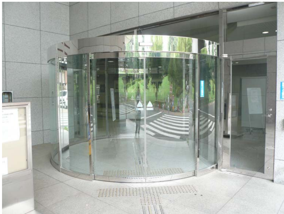
The automatic circular door at the entrance of the building