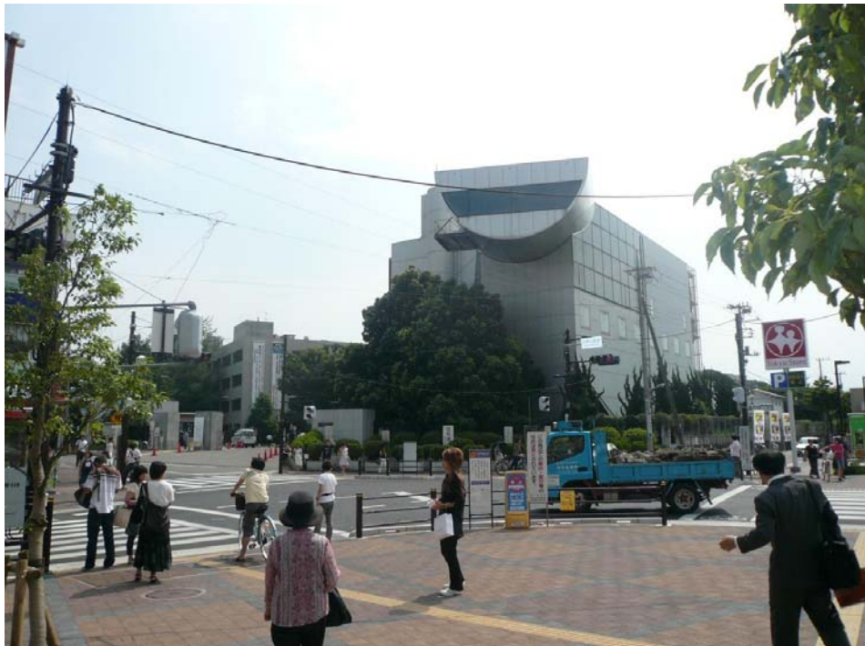
The main entrance of the Tokyo Institute of Technology (In front of O-okayama station)

Place: Tokyo Institute of Technology, Ookayama Campus (West building 9, Digital Hall and related room)