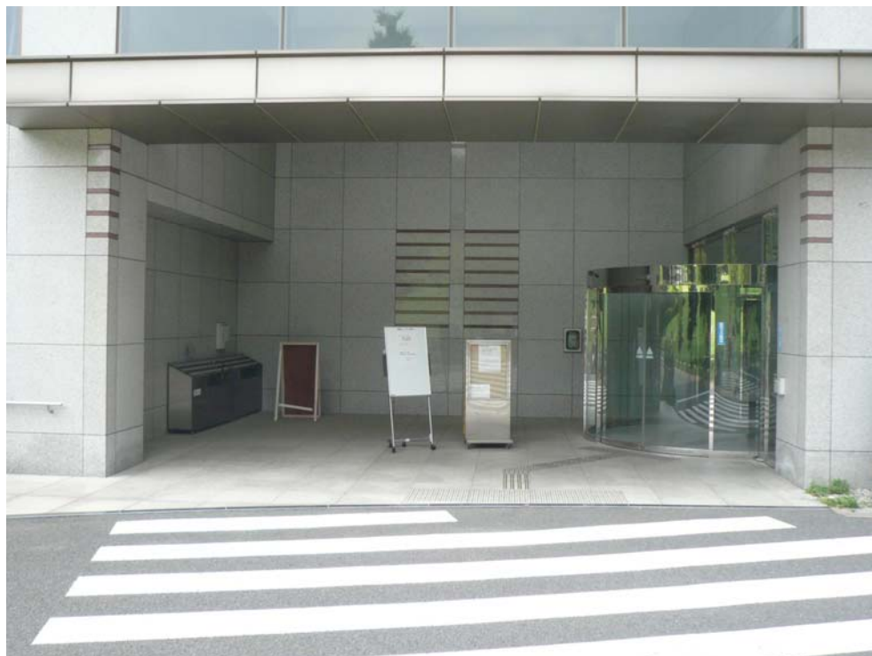
The entrance of West Building 9