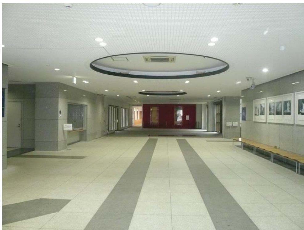
The exhibition area (in front of Digital hall) for conference registration and poster presentation