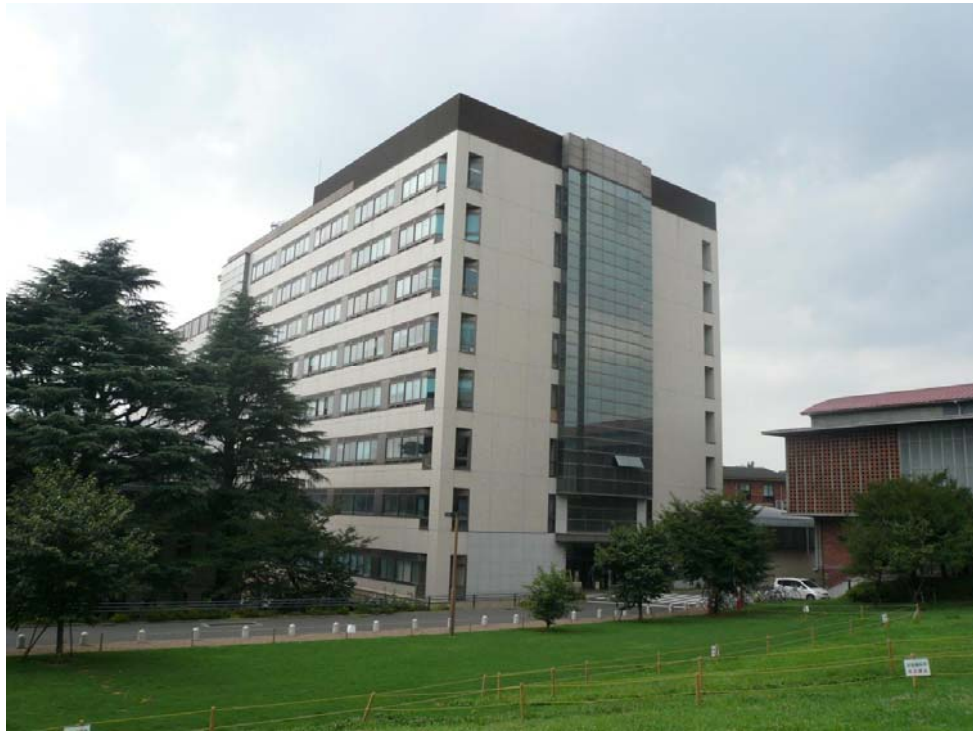
West Building 9 (Main building for TJIA 2008)